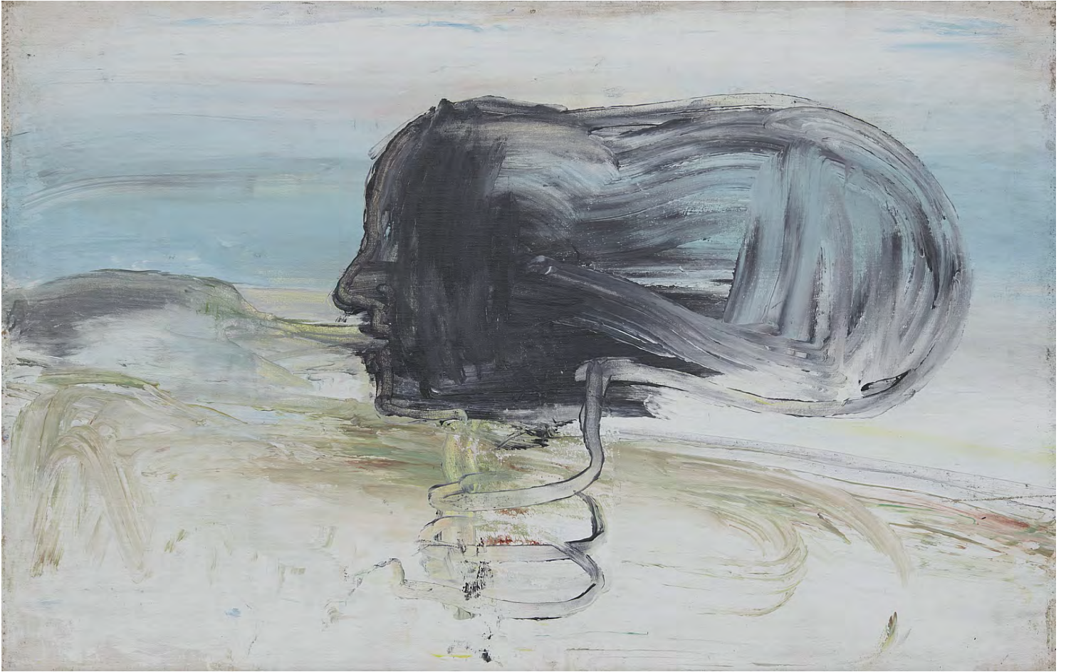
June Leaf The Mooring , 1979 acrylic on canvas 33 x 52" JL020