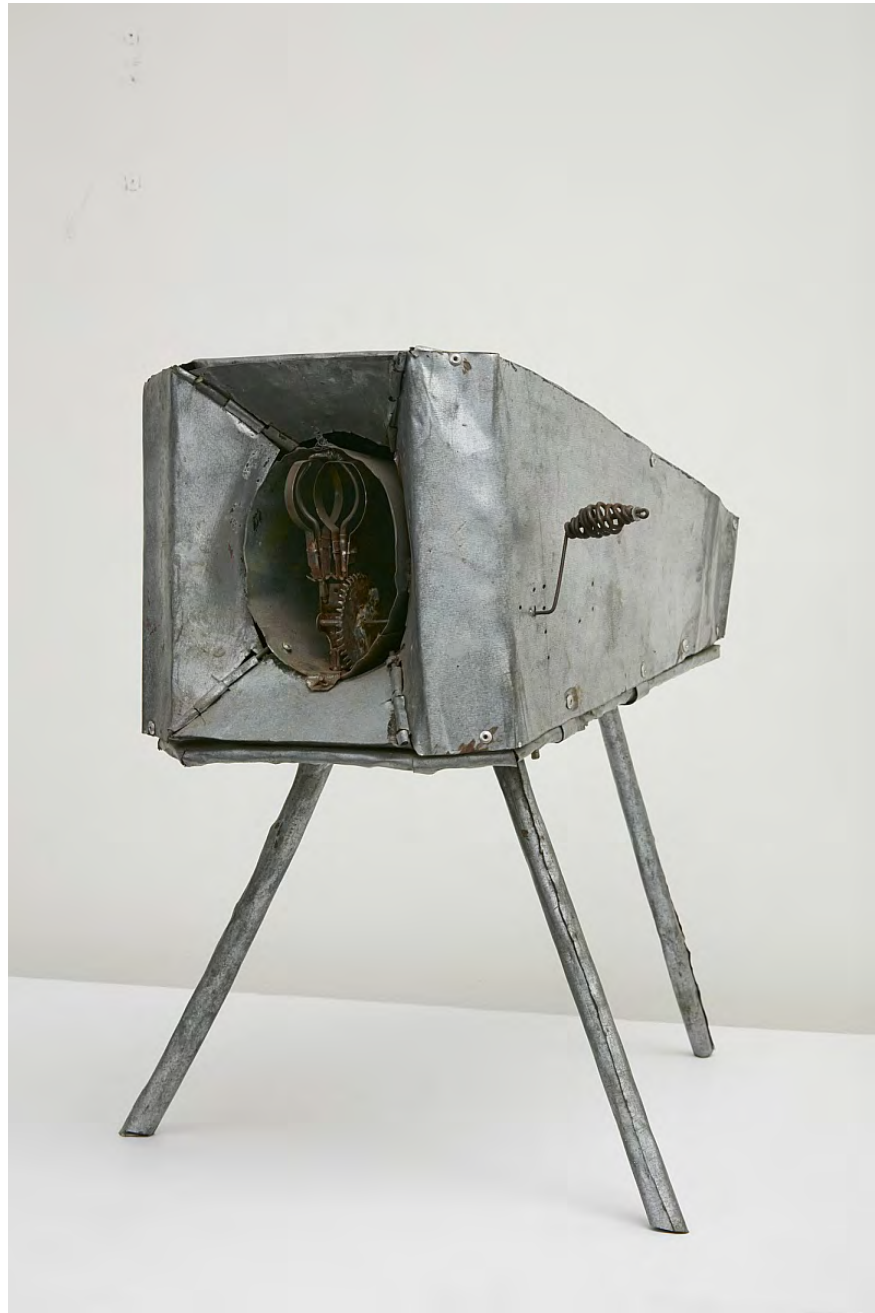
June Leaf Movie Camera , 2003 wood, tin, egg beater 17 3/4h x 18 1/2w x 12 1/4d in JL114