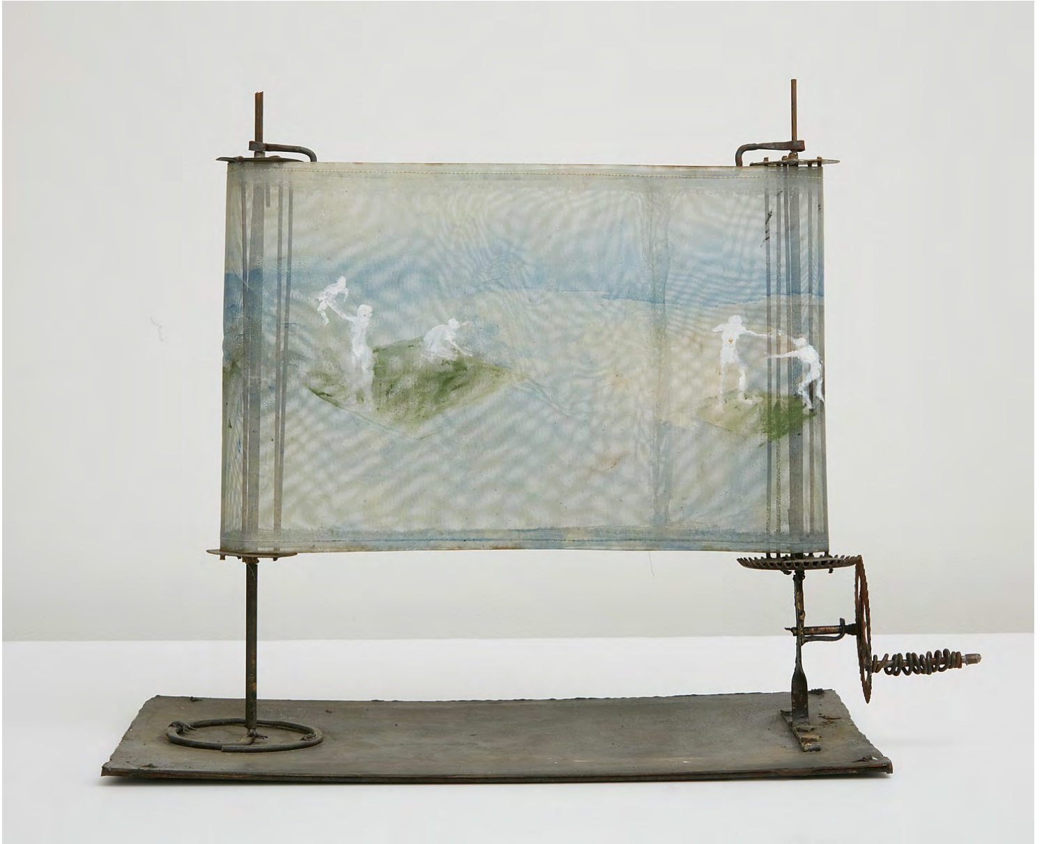
June Leaf Scroll with Figures (Family on a Raft) , 2008 metal, wire, acrylic on fabric 15 x 19 x 9" JL025