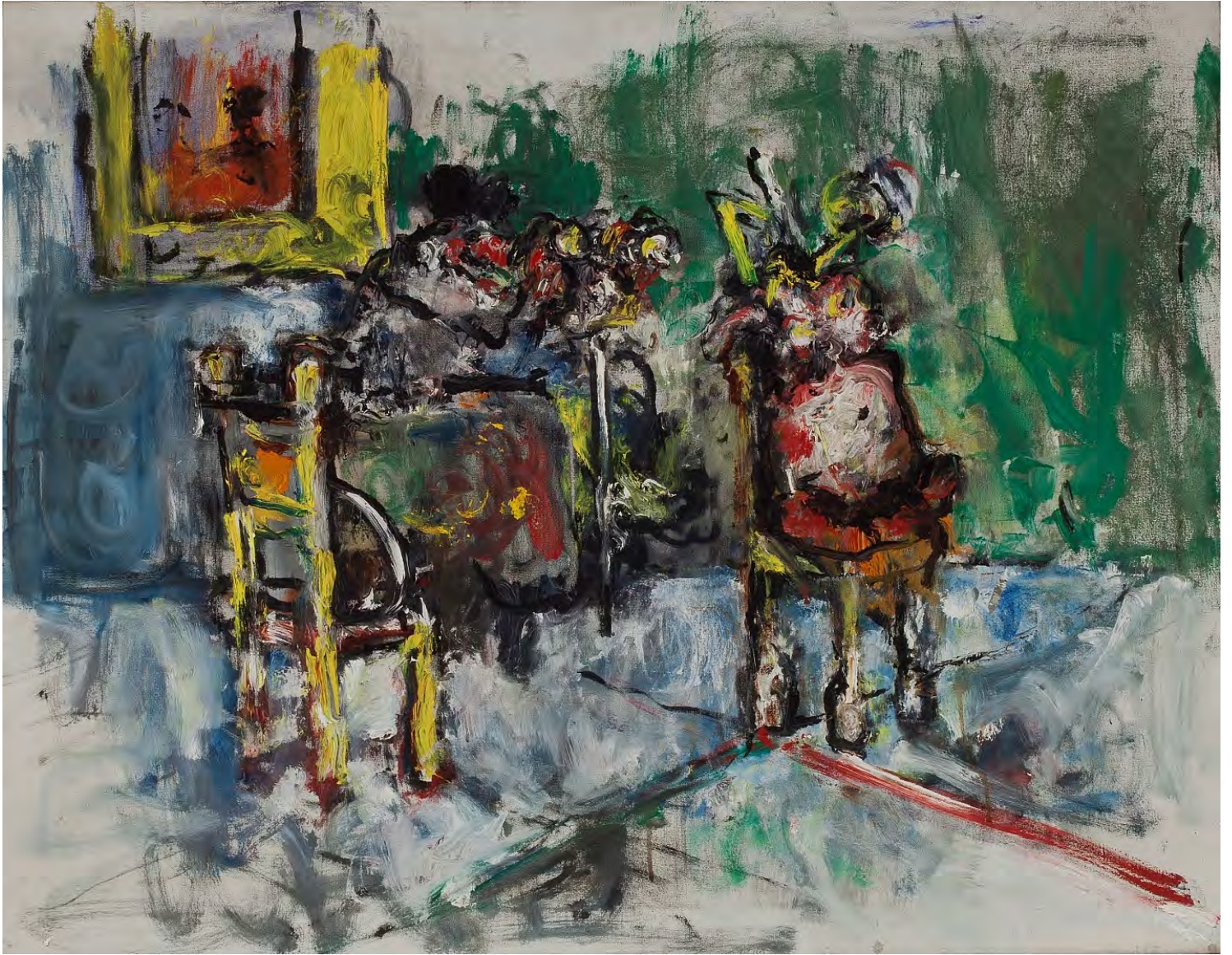
June Leaf Untitled , 1965 acrylic on canvas 30h x 40w in JL129

Collection The Smart Museum; gift of Joel Press