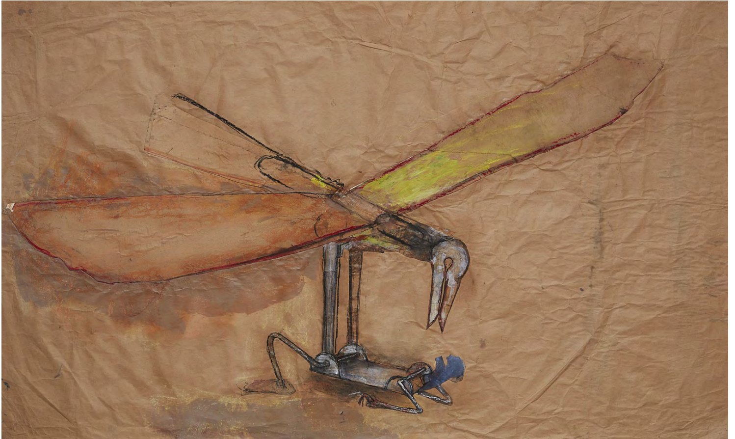
June Leaf Pencil Bird , 1985 pastel, ink, and acrylic on paper 29 x 49" JL012