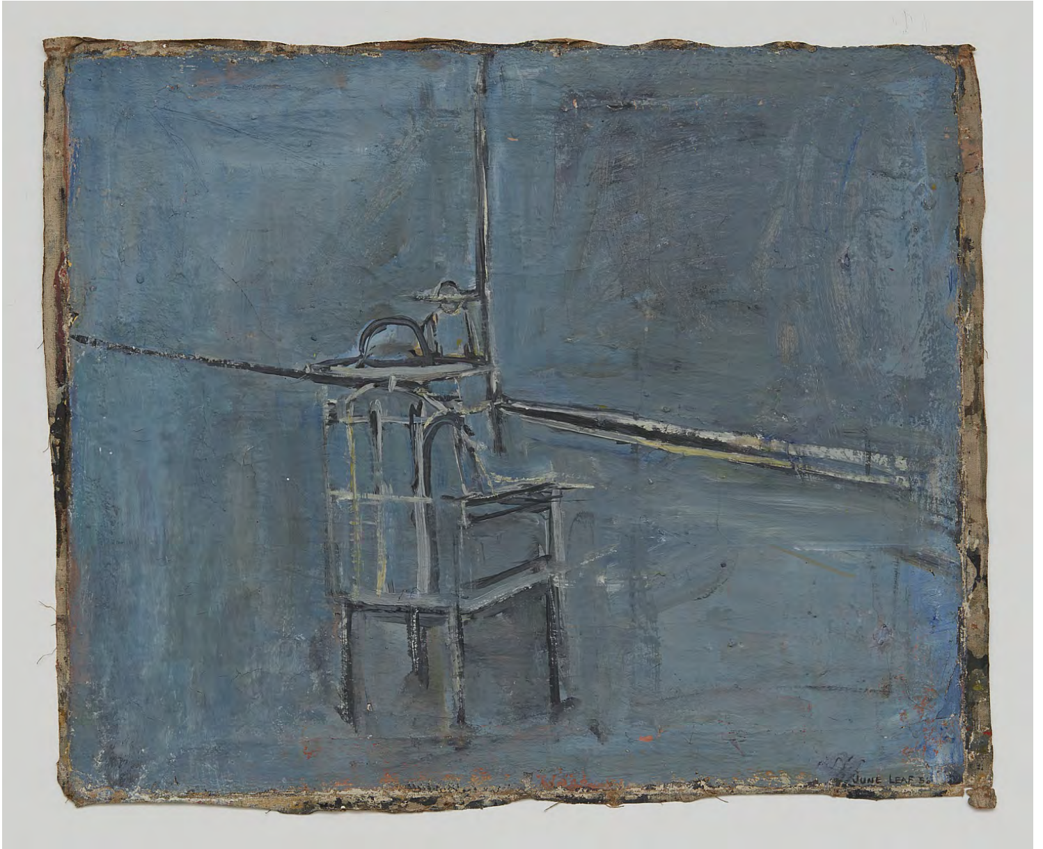
June Leaf Study for Arcade Women , 1956 acrylic on canvas 20-1/2 x 25" JL021