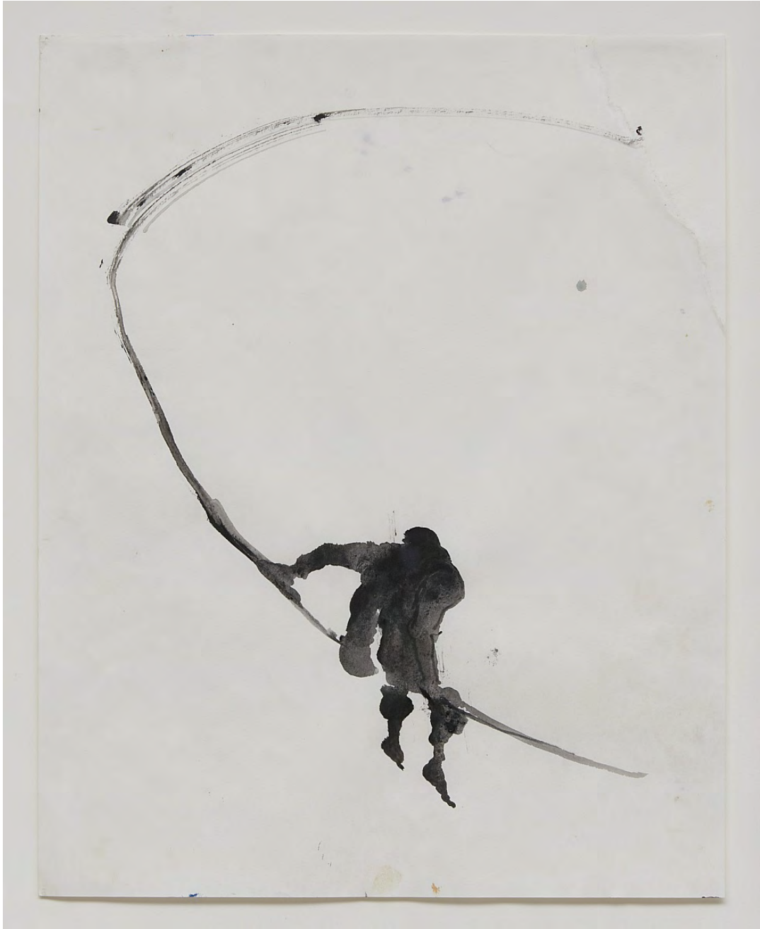
June Leaf Man on a Hoop , 2000 ink on paper 17 x 13-1/2" JL007 Private collection