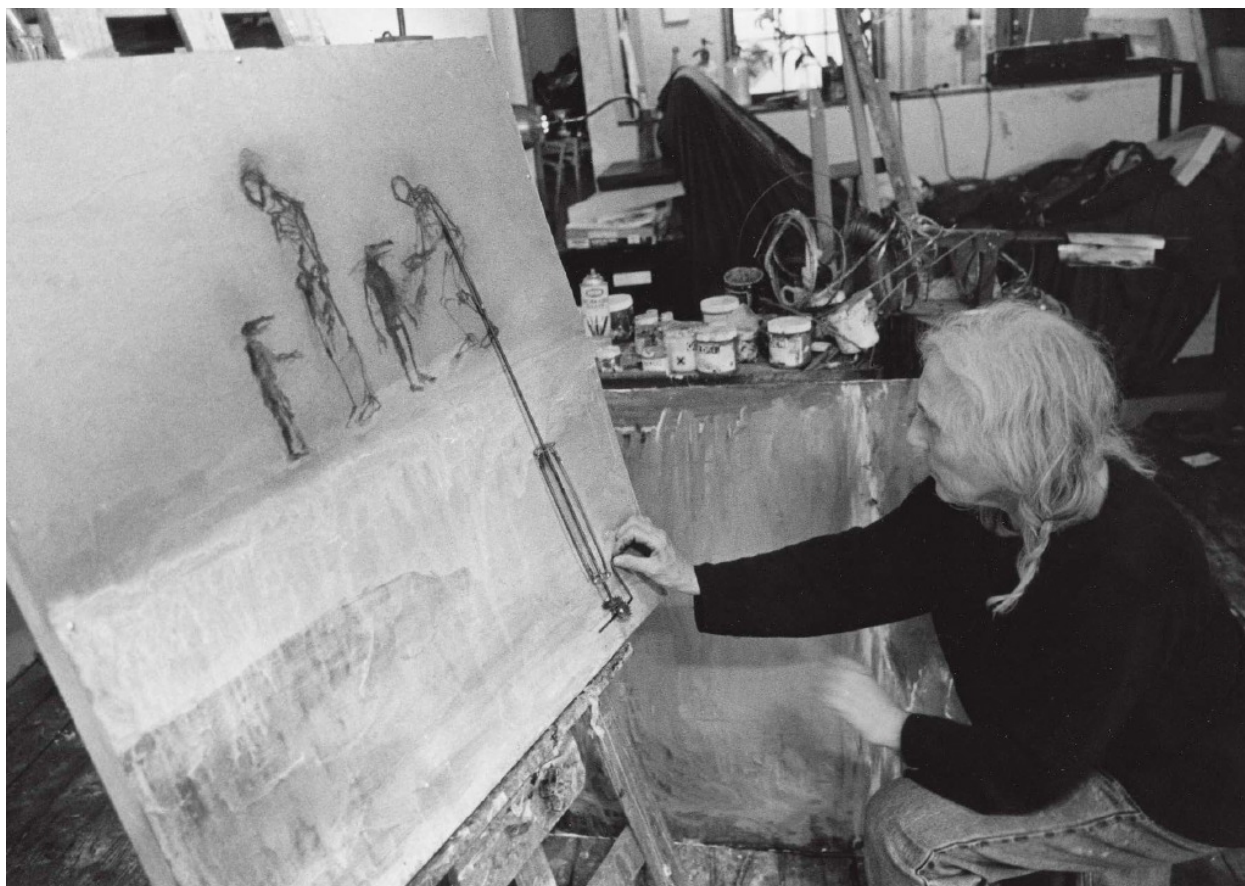
June Leaf in her NYC studio, 2004.