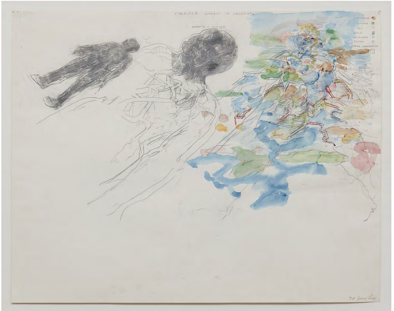
June Leaf Computer Woman in Landscape , 1975 graphite pencil with incising, and watercolor on paper 22-5/8 X 28-1/2" JL001