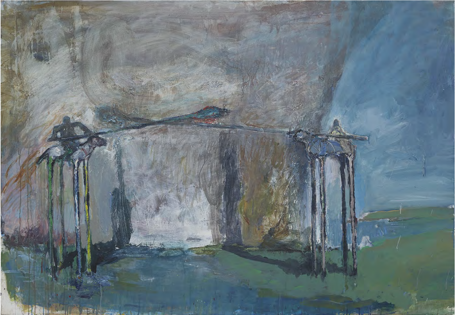
June Leaf The Painters , c.1975-80 acrylic on canvas 50 x 72" JL018